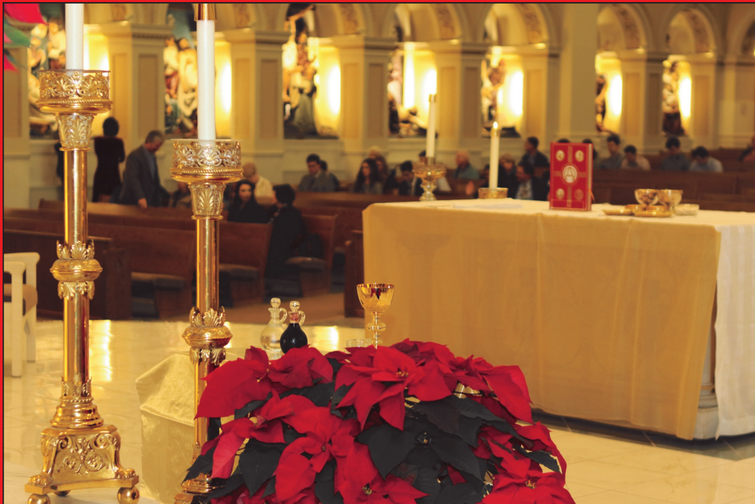
Christmas 2015