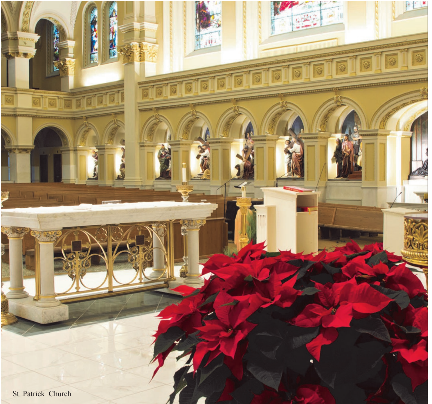
St. Patrick Church