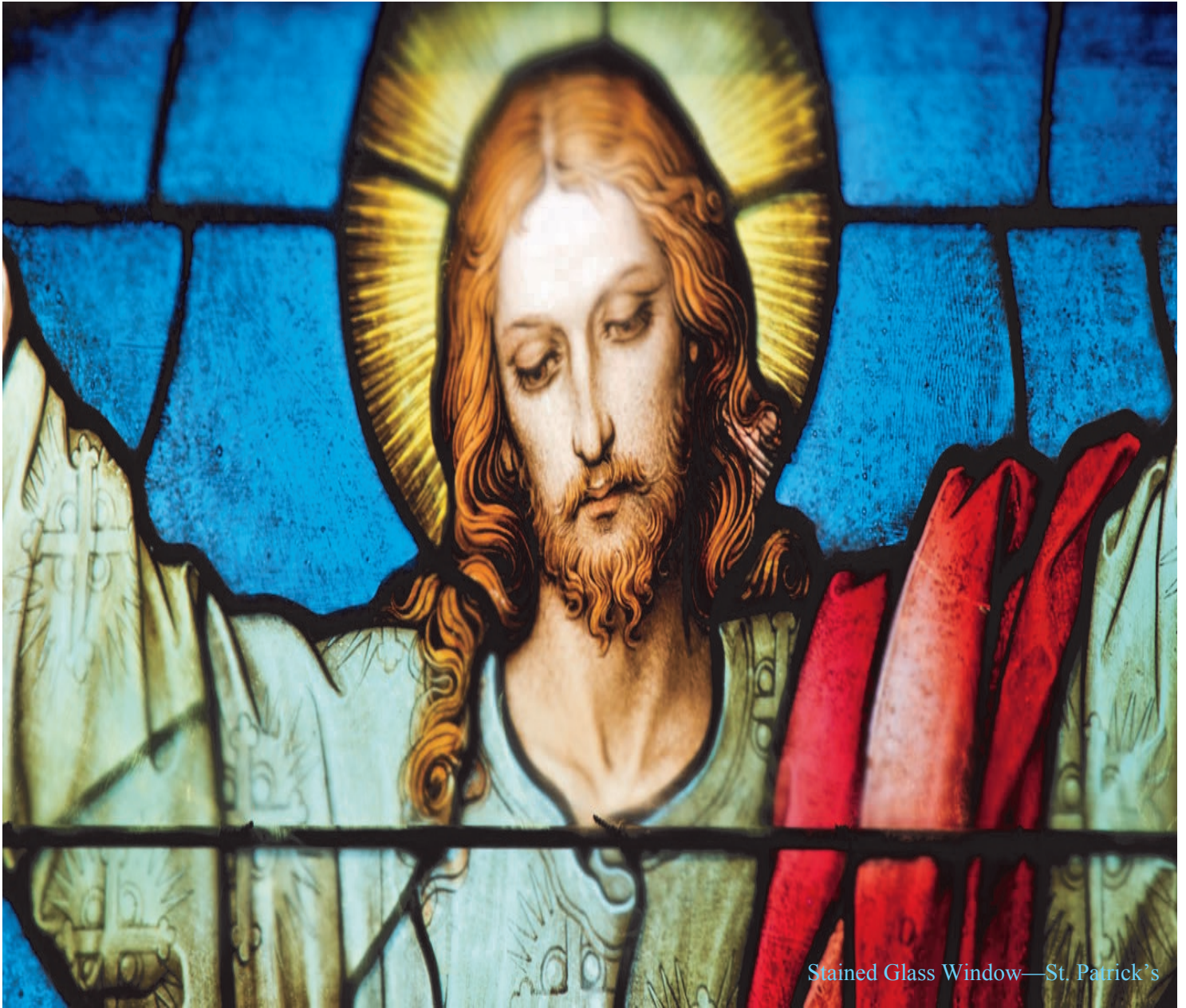
Stained Glass Window—St. Patrick's