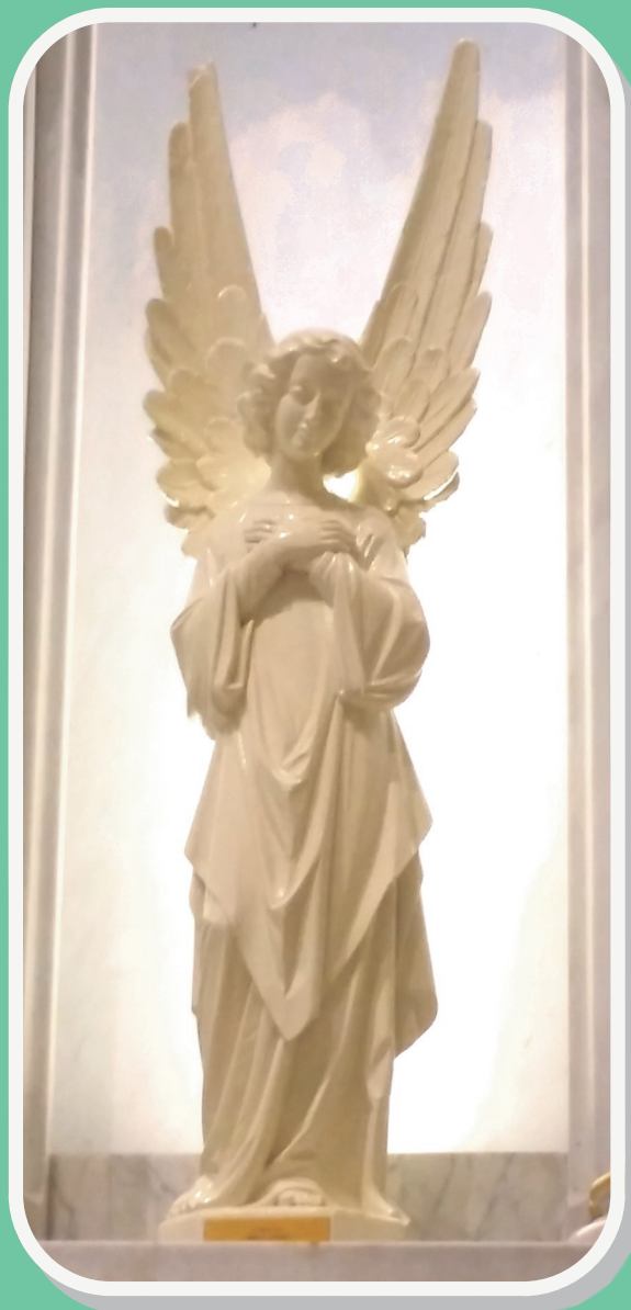
Altar Angels St. Patrick Church