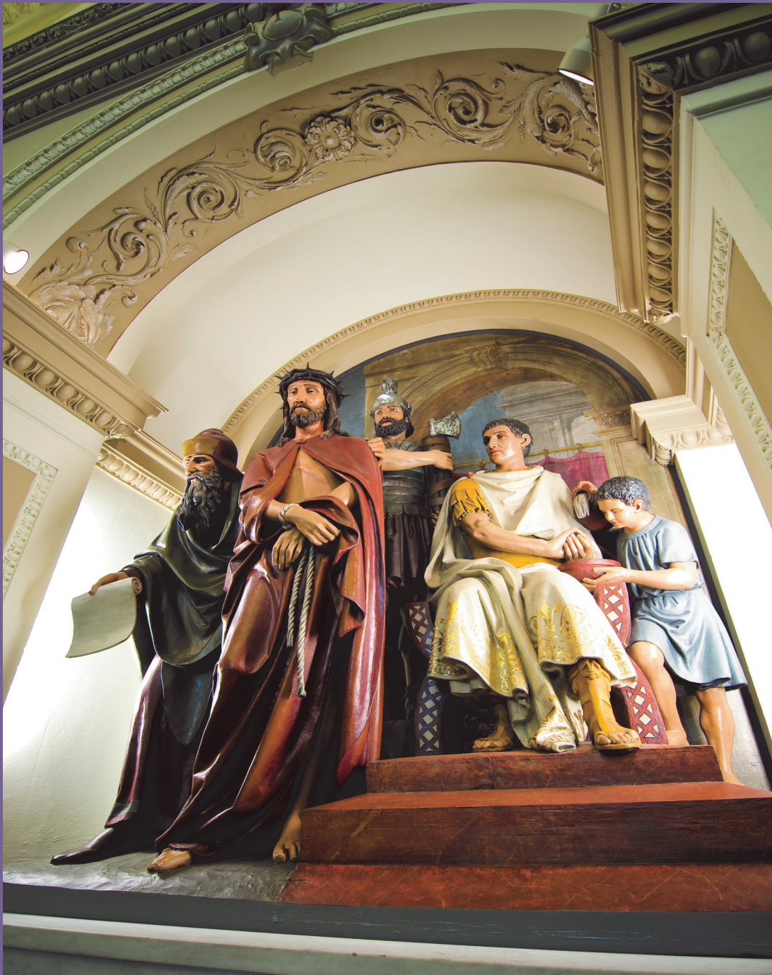
St. Patrick Station of the Cross