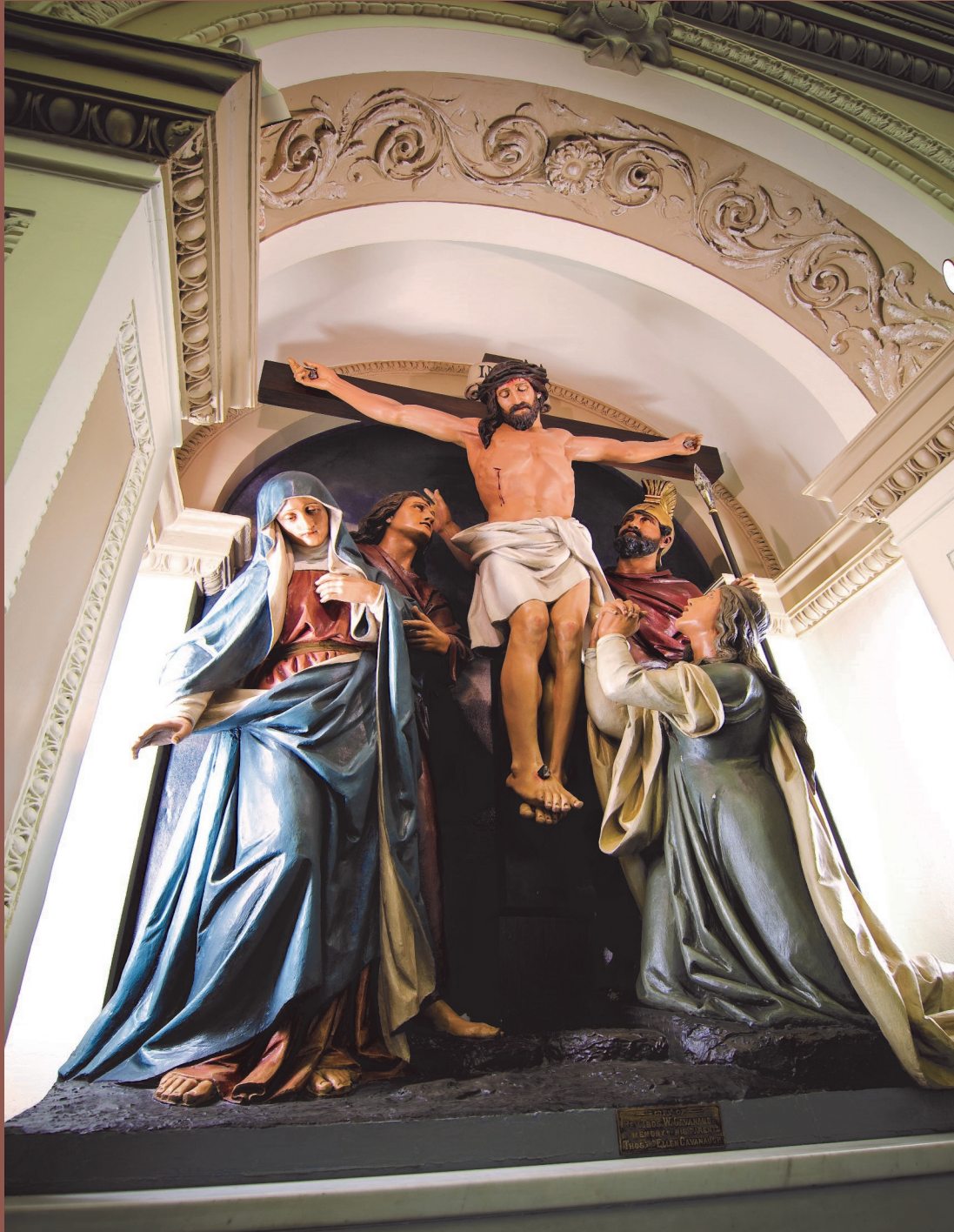
Station of the Cross at St. Patrick Church