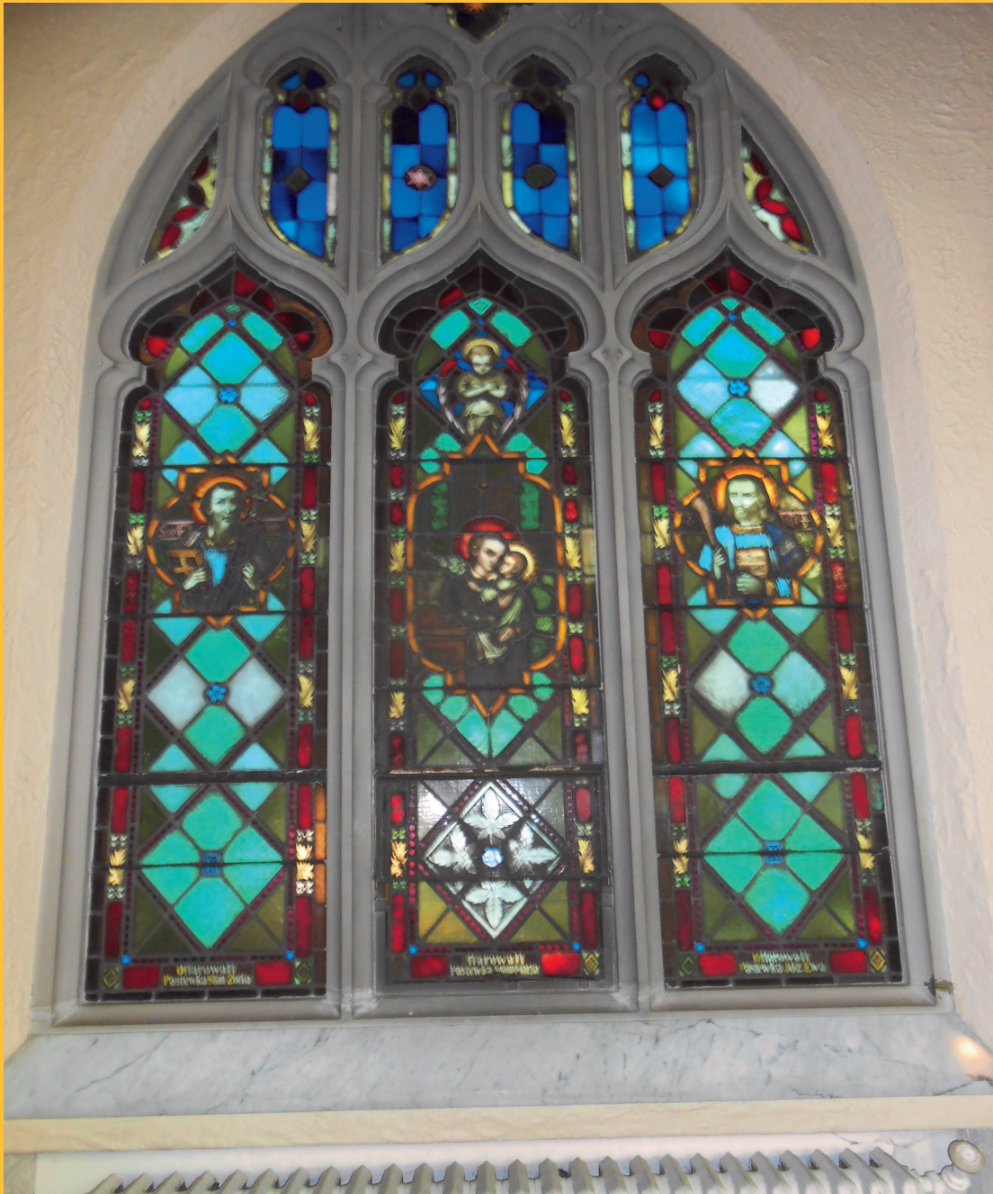
Stained Glass window at St. Hedwig