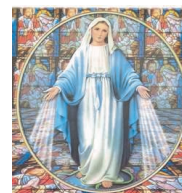
May, the Month of Mary