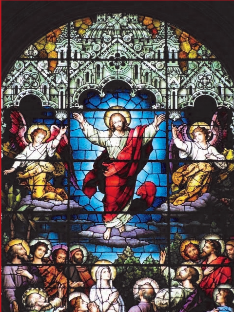
Ascension of the Lord Stained Glass Window at St. Patrick Church