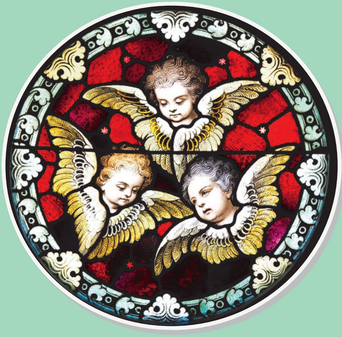
Stained Glass Window St. Patrick Church