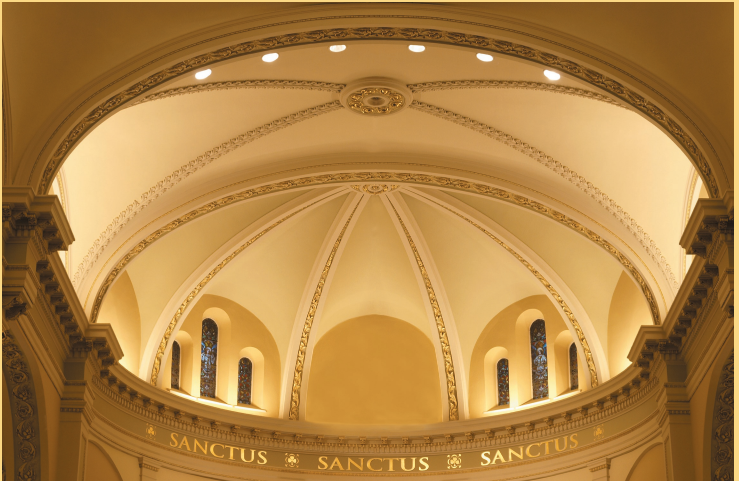
St. Patrick Church Sanctuary Dome