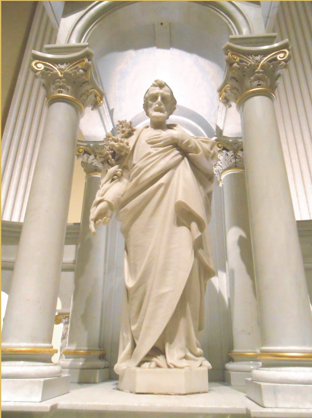
Statue of St. Joseph at St. Patrick Church