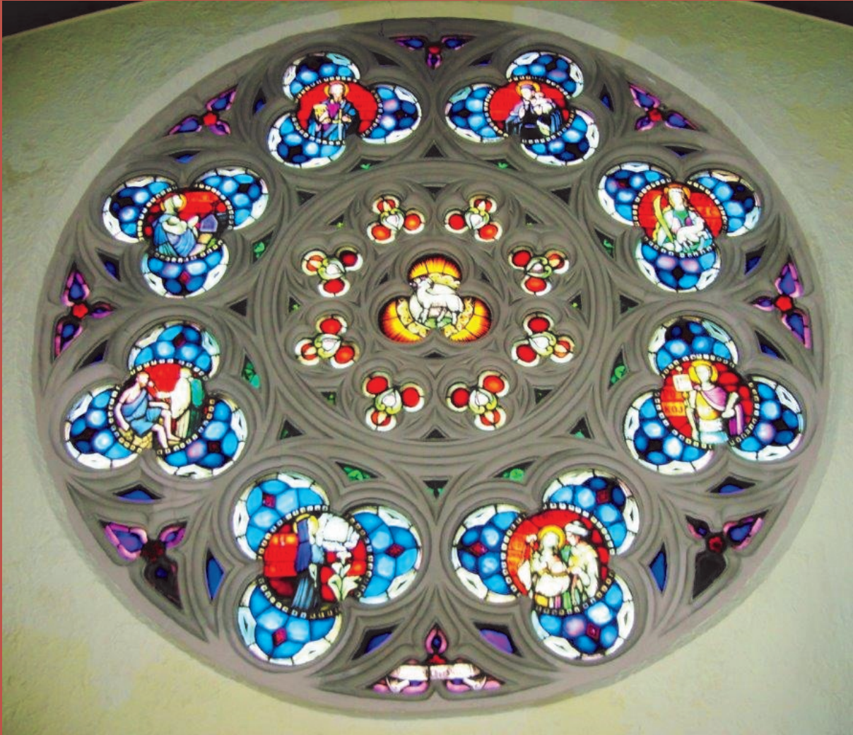
Rose window at St. Hedwig Church