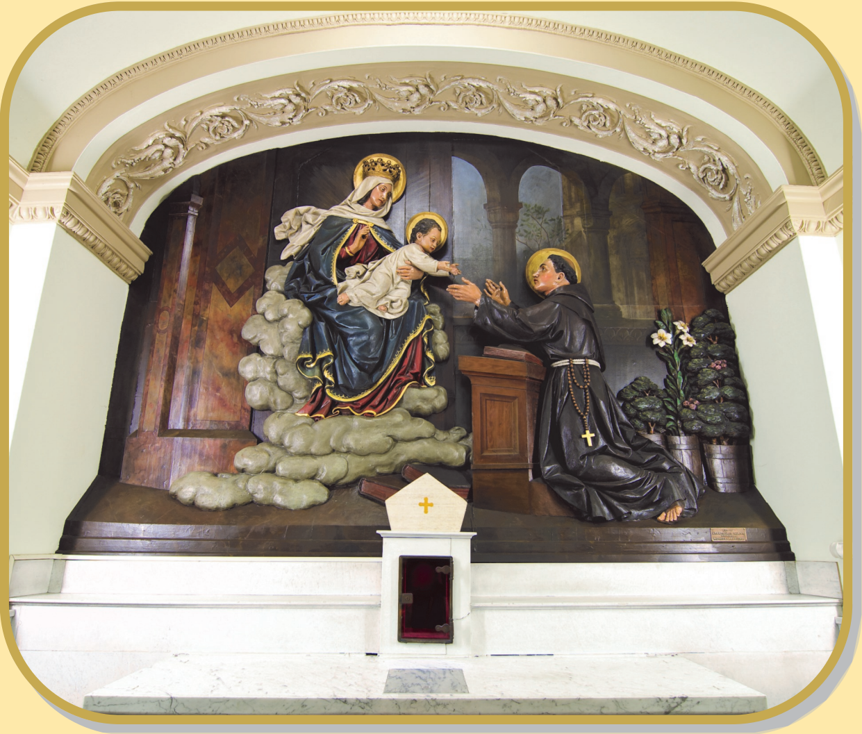
St. Anthony Shrine St. Patrick Church