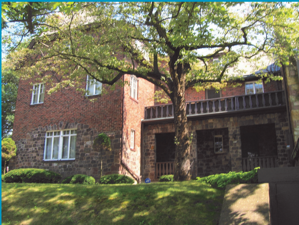
St. Hedwig Rectory