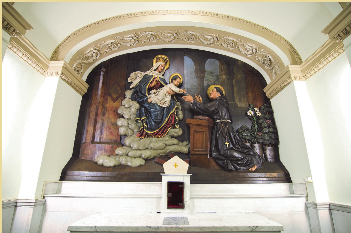
St. Anthony Shrine in St. Patrick Church