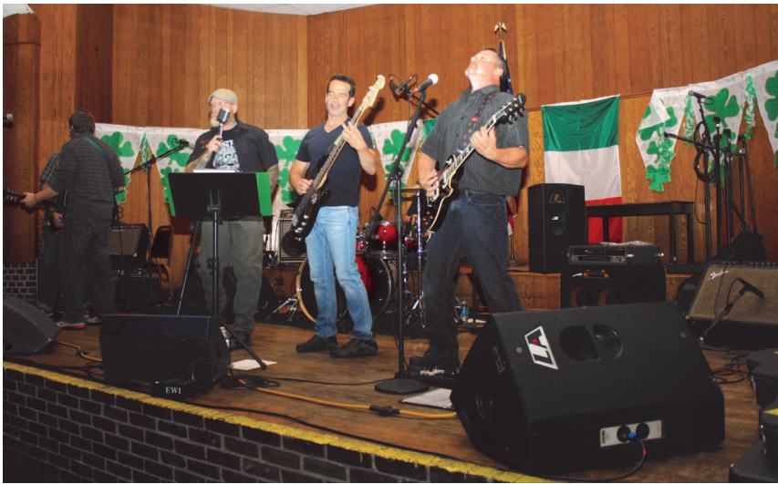
Saturday evening high energy Celtic rock bands & O'Kriegel's Pub & delicious Irish food!