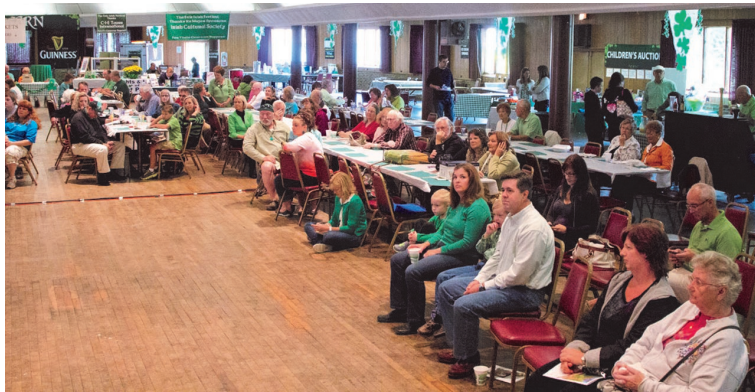
Sunday Irish Brunch featuring music by Celtic Creek.