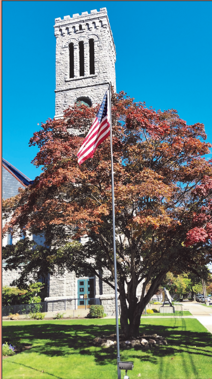
St. Patrick Church Fall of 2015