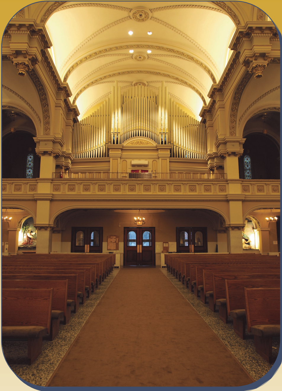
St. Patrick Church