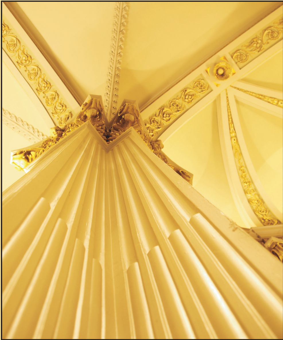
Pillar in St. Patrick Church