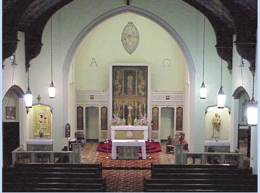
St. Hedwig Church Exterior and Sanctuary