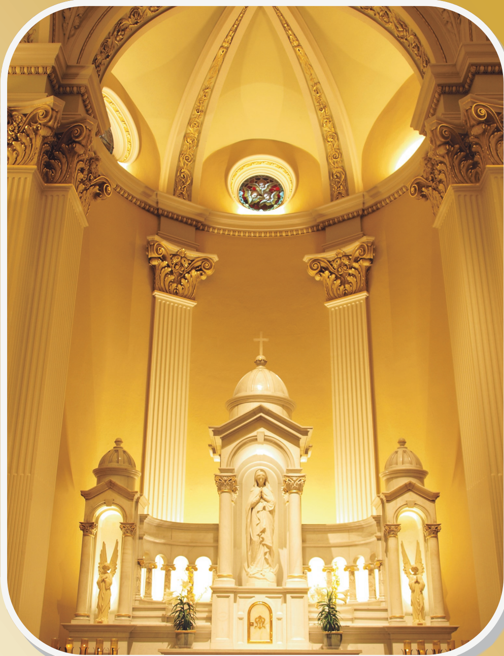
Mary's Altar St. Patrick Church