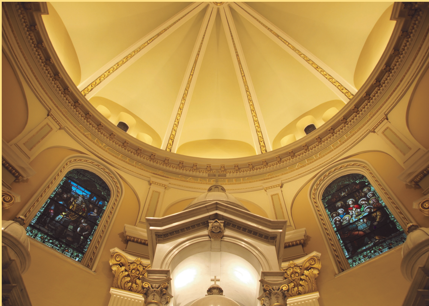
Sanctuary Dome in St. Patrick Church