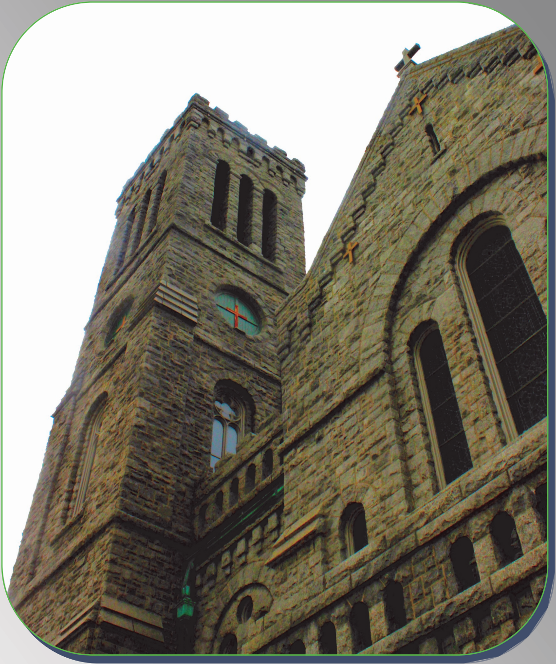
St. Patrick Church