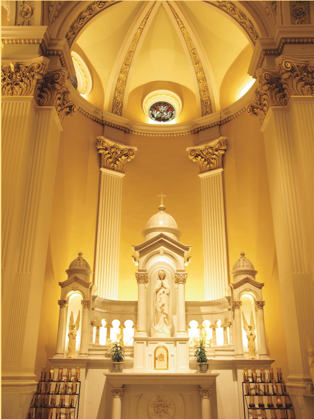
Mary's altar St. Patrick Church