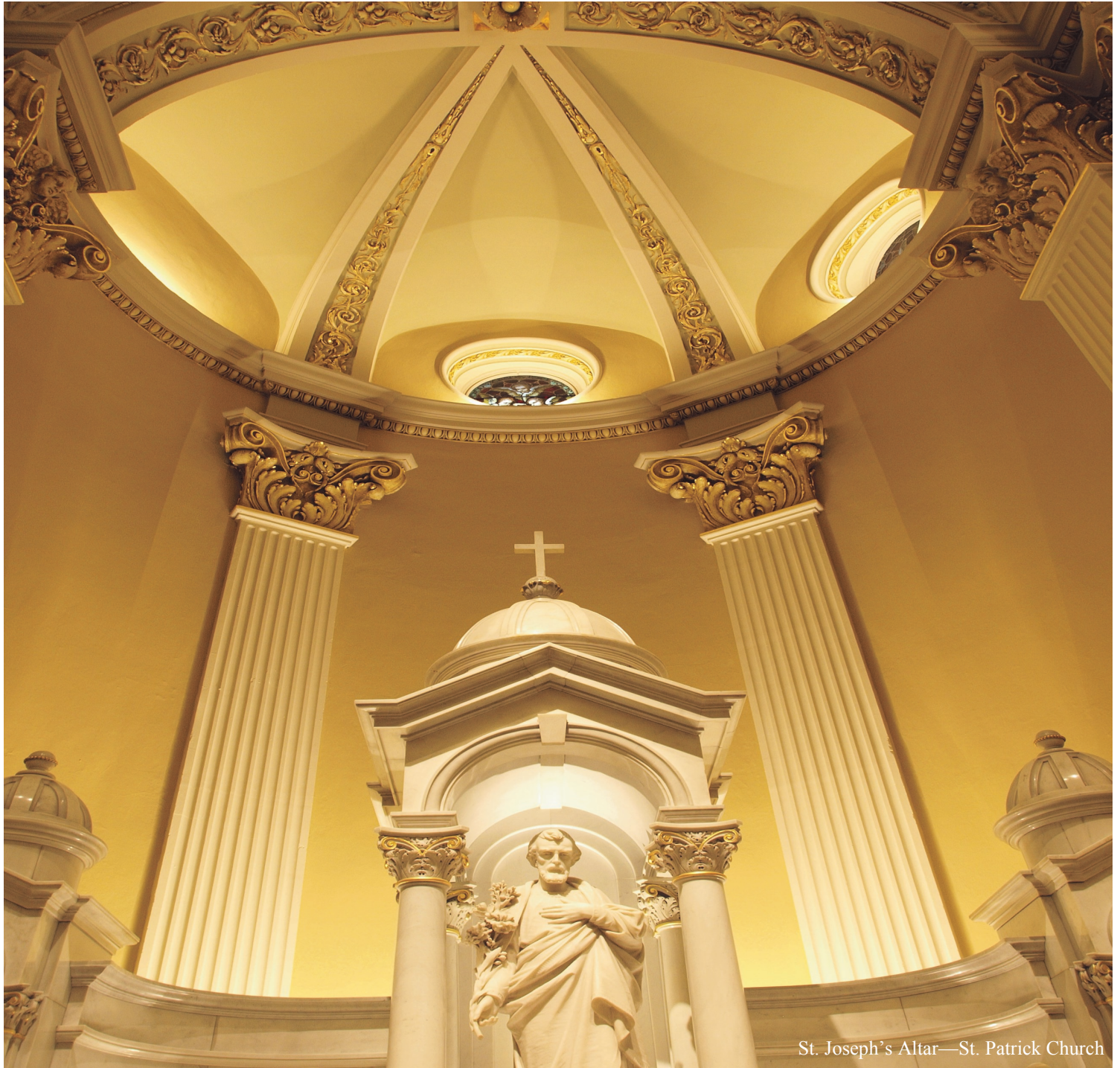
St. Joseph's Altar—St. Patrick Church