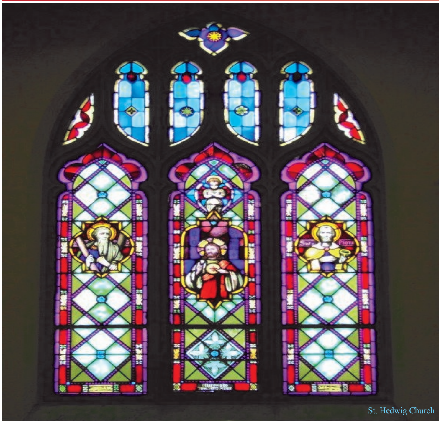
St. Hedwig Church