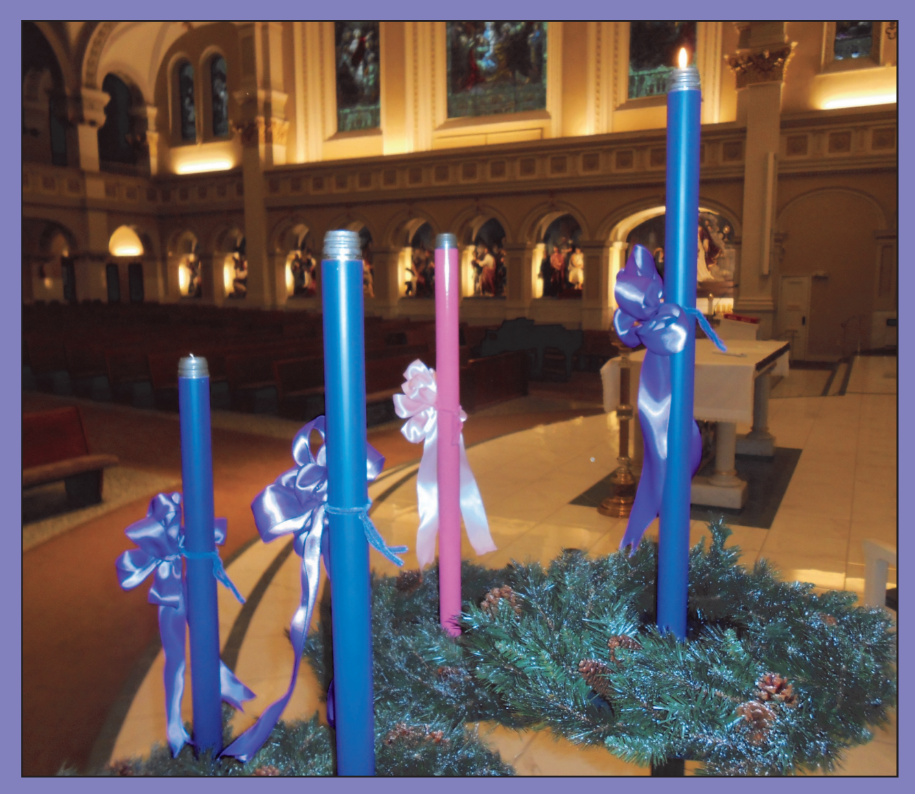
Advent Wreath St. Patrick