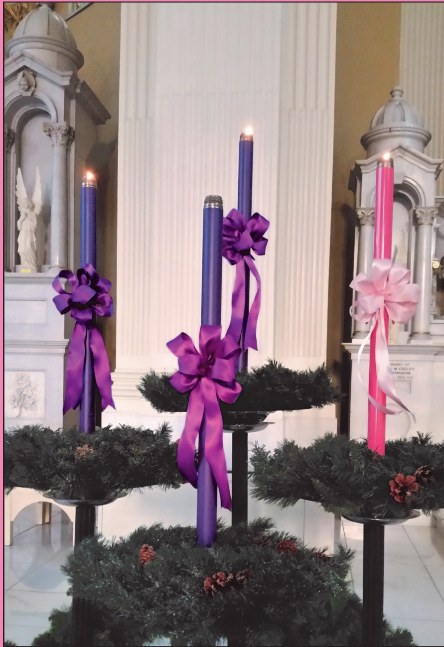
Advent Wreath St. Patrick