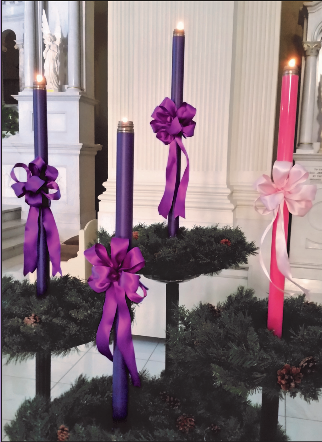
Advent Wreath St. Patrick